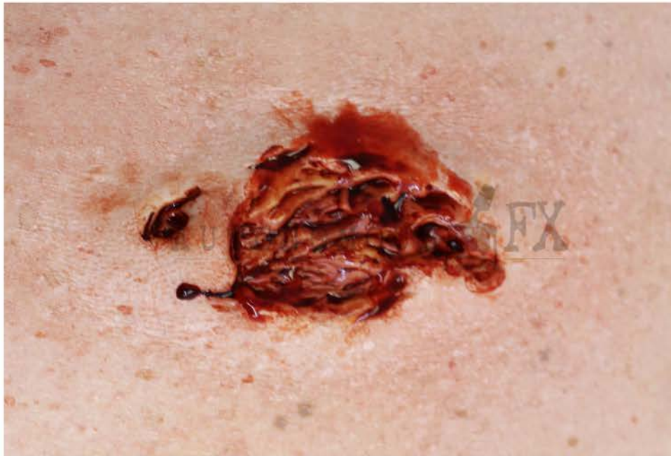
CATEGORY ; FLESH WOUNDS ITEM : FW-23