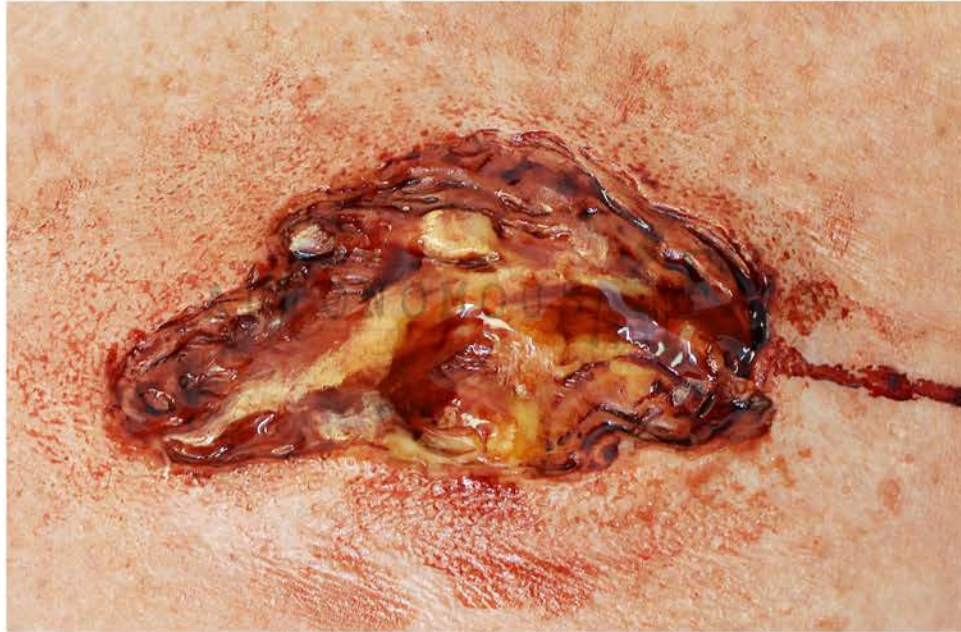
CATEGORY ; FLESH WOUNDS ITEM : FW-27