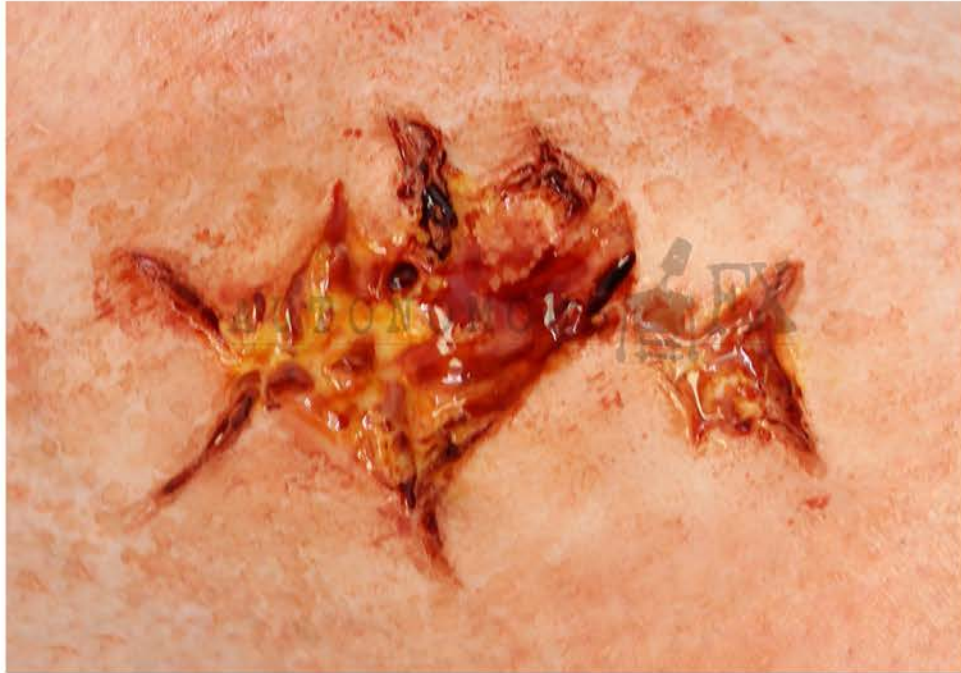
CATEGORY ; FLESH WOUNDS ITEM : FW-47