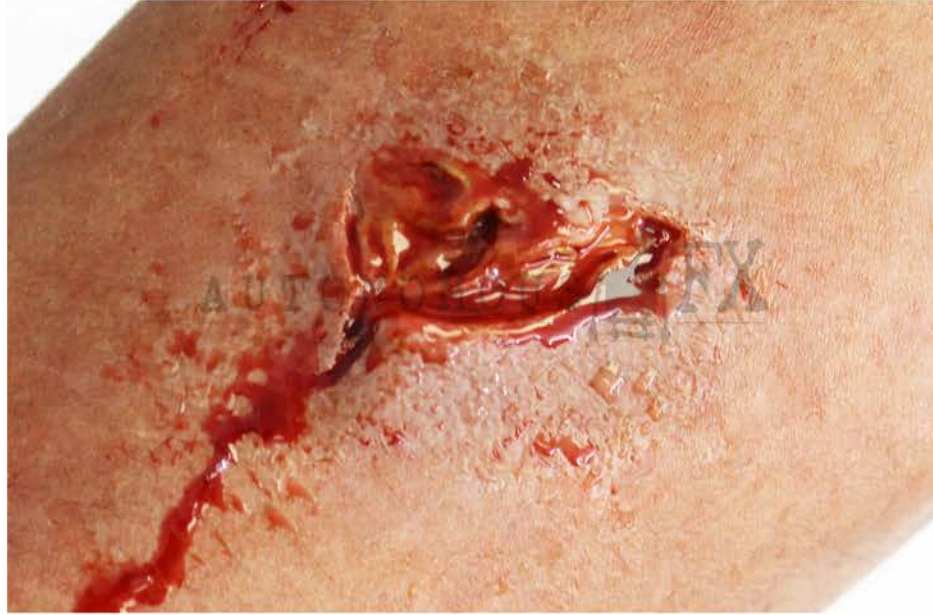
CATEGORY ; FLESH WOUNDS ITEM : FW-61