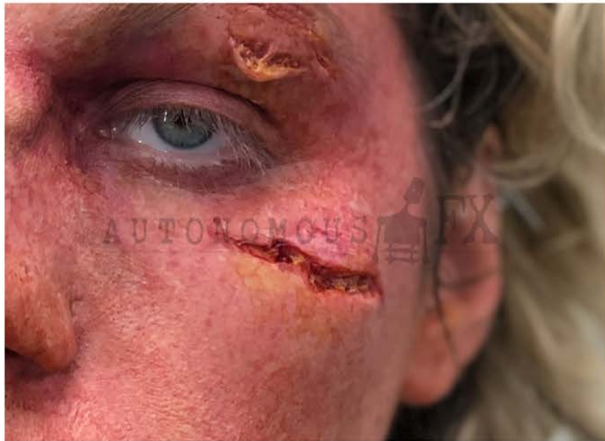
CATEGORY ; SWOLLEN EYES AND CHEEKS ITEM : SE-19