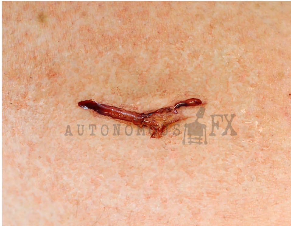
CATEGORY ; FLESH WOUNDS ITEM : FW-43